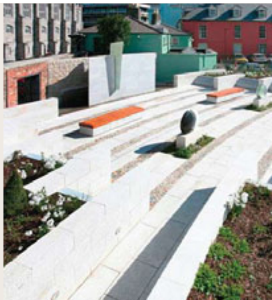
The new memorial garden in Dublin Castle honours the 83 Gardaí who were killed in the service of the State.

Speaking at the opening the Garda Commissioner said: "At 83 different moments in the last 88 years, time has stood still for the entire Garda family as reports have come in that there has been an incident - maybe a shooting, a collision, a drowning - and a colleague has been lost." The Commissioner commented that it is important that we take time to recognise and reflect on