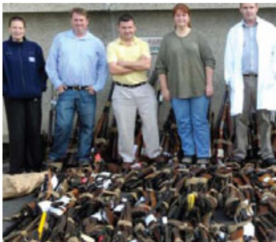
Members of the Ballistics section with some of the thousands of firearms that were voluntarily handed in at garda stations throughout the country.

A major benefit of the new licensing system is that over 45,000 old one-year licenses were cancelled from the system. This resulted in the voluntary handing in of thousands of unwanted firearms at garda stations throughout the country. The firearms were then destroyed free of charge. This is a service for which firearm certificate holders might otherwise have had to pay.