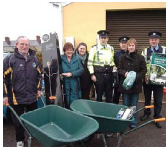
Community Gardaí present Residents Groups with equipment in November 2010.

Free smoke alarms, high visibility jackets and crime prevention information leaflets were handed out to all attendees. About 100 people attended and the event was well received. As a result, similar events were run in each of the Meath Districts in 2010.