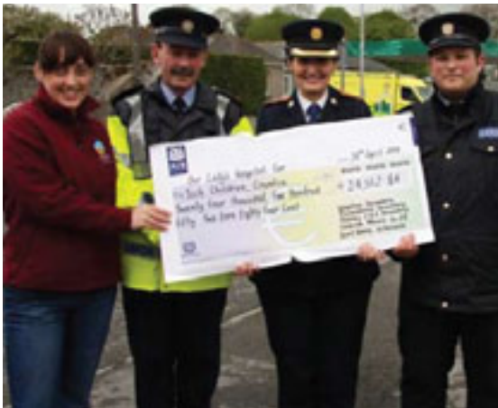
Gardaí from Thurles helped to raise 24,552.84 for Our Lady's Hospital for Sick Children with the "Wellie Run" in April 2010.

which is awarded by our Lady's Hospital.