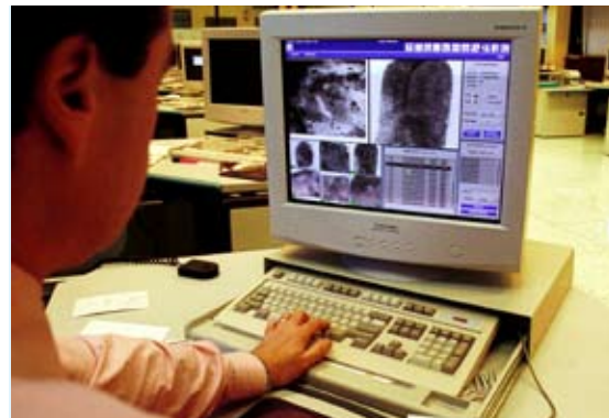
Advances in scientific technology mean that new evidence can be submitted in unsolved murders and other crimes.