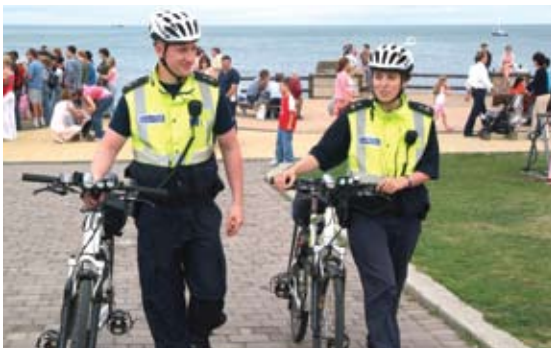
Good community policing practices are captured and disseminated to community policing teams throughout the country.

Throughout 2010, the National Crime Prevention Unit (NCPU) carried out research into best crime prevention and reduction practices and provided advice and support to the public. The unit was also involved with running two successful Garda Community Safety Weeks which were held in April and September.