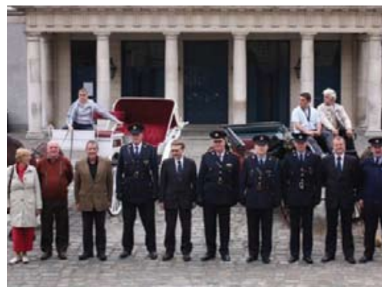
The very last inspection of horse-drawn carriages took place in Dublin Castle in May 2010.

It was the end of an era for the Carriage Office on 31 May 2010 when the very last inspection of horse-drawn carriages took place in Dublin Castle. The Office, which had been based at the Castle since 1856, has now moved to Santry.