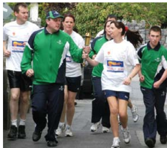
Special Athletes accompanied by PSNI officers and Gardaí carry the Olympic Torch into Limerick City.