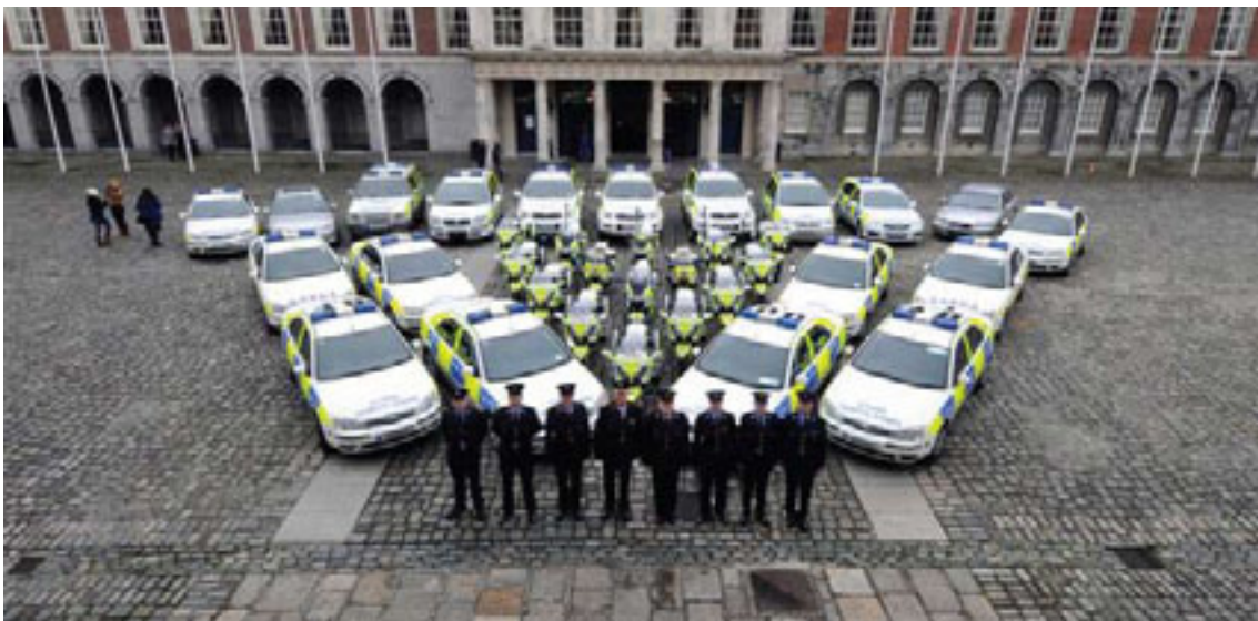
A fleet inspection takes place at Dublin Castle in November 2010.

CARS is now in its fourth year on the Dublin Institute of Technology (DIT) curriculum. The Garda Road Safety Unit has been an integral part of the CARS Programme since it began four years ago.