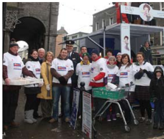
Gardaí from Kilkenny Garda Station raised 7,500 for Special Olympics Ireland by selling donuts.

The CPU and other Gardaí from Kilkenny Garda Station braved the cold weather to sell donuts for Special Olympics Ireland. This activity took place in December and they raised 7,500. The event was supported by well-known rugby legend Mick Galway.