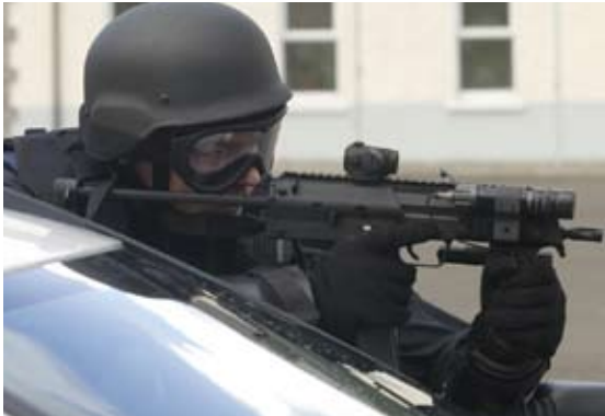
The Emergency Response Unit (ERU) is under the remit of the Special Detective Unit.

teams. Members of the ERU received training in France, Greece, Holland, Germany and the UK.