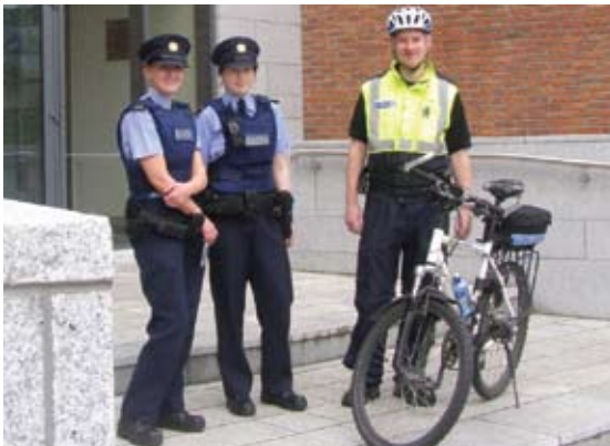
The new District Headquarters Station at Buncrana.

The new District Headquarters Station at Buncrana was officially opened by Minister for Justice, Equality and Law Reform Mr. Dermot Ahern TD on 11 October 2010.