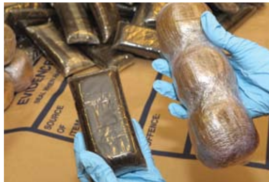
Operation Shovel was a multi-national operation which targeted one of the largest Irish crime gangs who wielded control over a large portion of the European drug trade.

Crime legislation). These were the first arrests to be made under this new legislation.