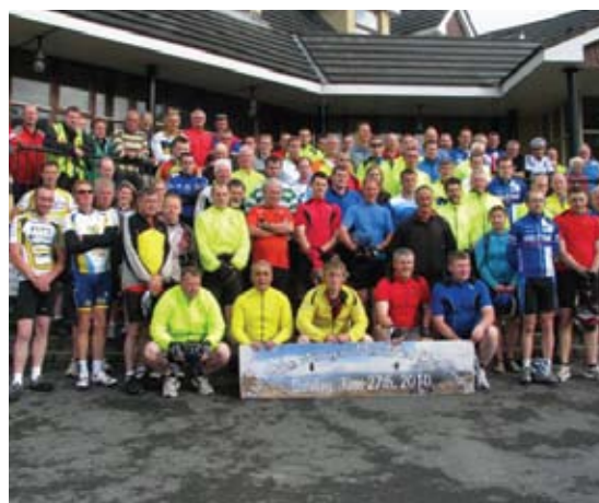
Participants in the Mulryan challenge raised almost 30,000 for the Milford Hospice in Castletroy.

for elderly people. The Gardaí cycled 150 kilometres, starting and finishing in Ennis. An enjoyable day was had by all and 5,600 was raised for this worthy cause.