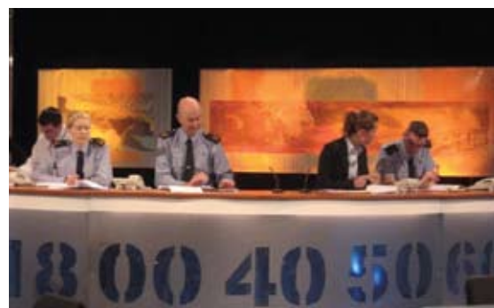
The television programme Crimecall assists both An Garda Síochána and members of the public.

The television programme Crimecall , which airs on RTE1, plays a valuable role in assisting Gardaí with investigations and informing the public about crime and crime prevention. Each episode presents news stories and features, crime reconstructions, live studio appeals and CCTV footage from around the country. During 2010, ten Crimecall programmes were shown, with an average of 380,000 viewers per episode. Many high profile cases were featured on the programme throughout the year including both current and historical cases.