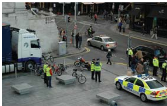
The launch of an enforcement and safety education operation on Dame Street in October 2010 which targeted pedal cyclists.

On 20 October 2010, an enforcement and safety education operation targeting pedal cyclists was launched on Dame Street in Dublin. This operation formed part of the Dublin Metropolitan Region’s Casualty Reduction Implementation Plan, which ran for eight weeks during October and November 2010. During the operation, cyclists were invited to sit into the cab of a Heavy Goods Vehicle (HGV), provided by the Road Haulage Association, to view at first hand how difficult it can be for drivers to see cyclists on the road if they are not using lights or wearing high-visibility clothing.