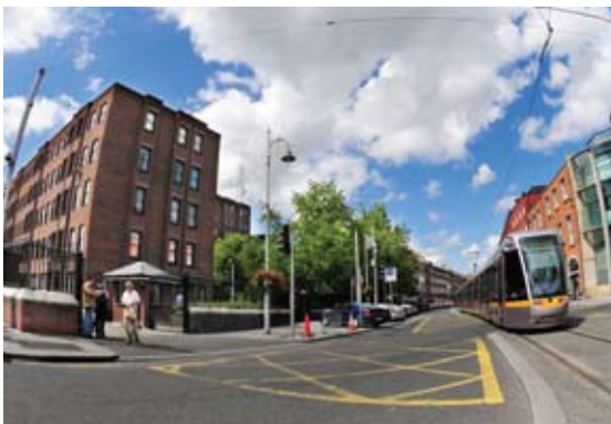
The Special Detective Unit is based in Harcourt Square in Dublin.

The SDU continues to gather, analyse and disseminate information relating to groups and individuals involved in subversive activity, global terrorism and organised crime. It also liaises with its European and worldwide partners to better share and analyse information. This co-operation allows a targeted approach against cross border terrorist activity, which has resulted in the prevention and disruption of offences carried out by dissident republicans.