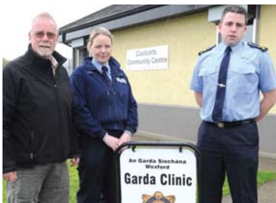
One of the four new community clinics that opened in Wexford in 2010.

Four new community clinics were opened in the Wexford Division. The clinics offer the community a chance to have their passport or tax renewal forms signed or to talk to their local Gardaí. The initiative has had a great response from the community.