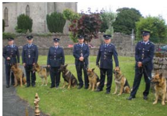
The Garda Dog Unit celebrated 50 years in existence in 2010.

Training is conducted by the Garda Dog Unit and continues daily for the duration of a dog's career. The dogs live in their handler's home, so they build up a relationship with their handler, although they understand the difference between work and off duty.