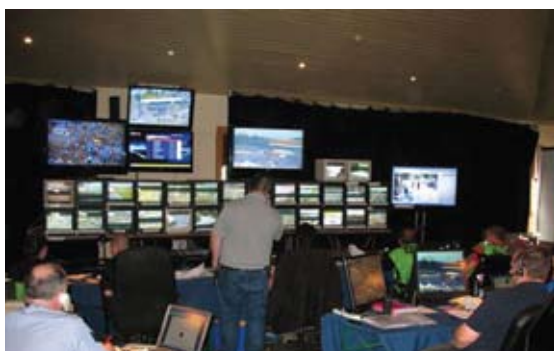
The new joint event control room at Oxegen facilitated more efficient incident management and crowd control.

The annual Oxegen festival was held at Punchestown Racecourse, Naas, Co. Kildare from the 8th to 12th July 2010. This event is the biggest outdoor musical festival held in Ireland. Over 70,000 campers stayed on a 400 acre site for five days and a further 10,000 non-campers attended daily.