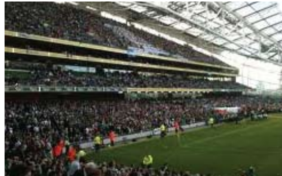
Gardaí were closely involved during the construction and development of the Aviva Stadium.

on wheels’ and visited older residents throughout the area. Gardaí cleared snow and gritted paths to ensure access to local shops, and bought food and other supplies where necessary. This contact helped to further the existing good relationship between Gardaí and people in the community.